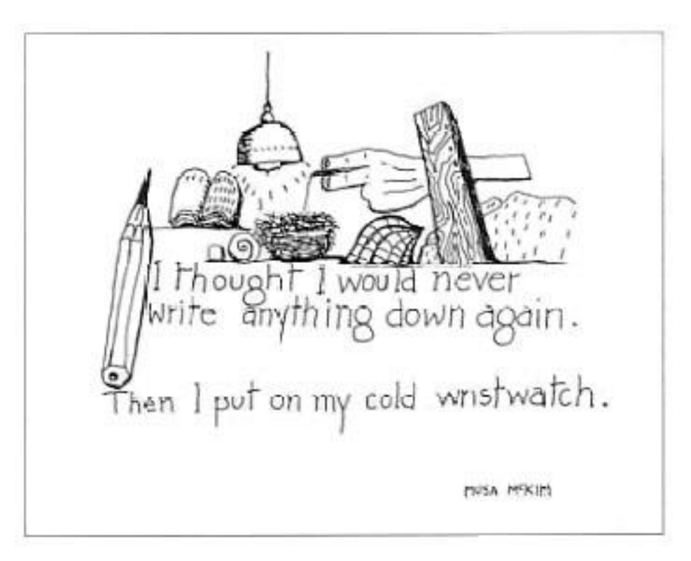
Philip Guston and Musa McKim, I thought I would never write anything down again, mid-1970's, ink on paper

I think that probably the most potent desire for a painter, an image-maker, is to see it. To see what the mind can think and imagine, to realize it for oneself, through oneself, as concretely as possible. I think that's the most powerful and at the same time the most archaic urge that has endured for about 25,000 years. In about 1961 or 1962 the urge for images became so powerful that I started a whole series of dark pictures, mostly just black and white. They were conceived as heads and objects.